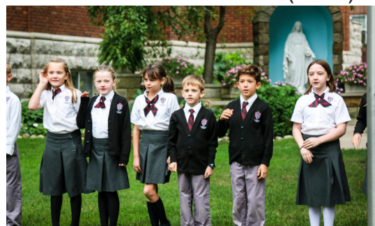
WE'VE GROWN FROM 69 STUDENTS IN 2013 TO 321 IN 2019!

ALL OF OUR STUDENTS ATTEND AND OFTEN SERVE IN DAILY MASS, WEEKLY ADORATION & BENEDICTION. ALL CLASSES PARTICIPATE IN MONTHLY CONFESSIONS.