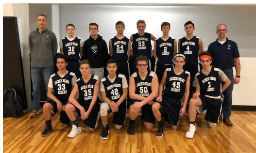
HIGH SCHOOL ATHLETICS IS GROWING AT SHA WITH BASKETBALL, VOLLEYBALL AND BASEBALL!