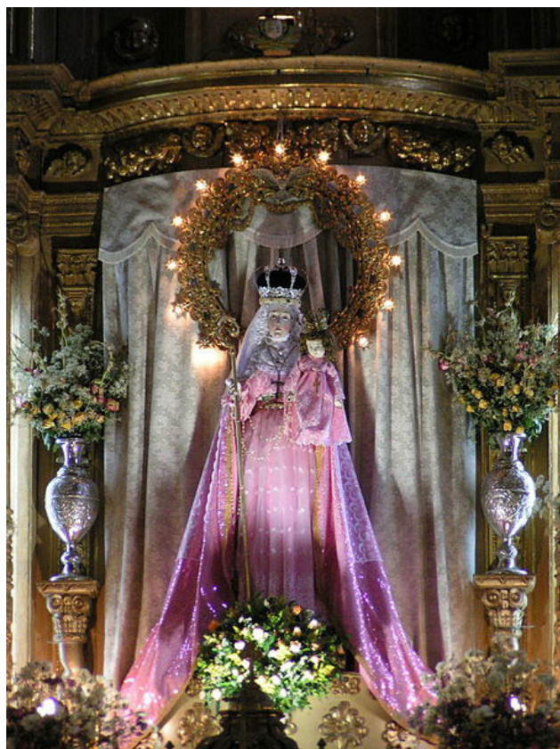
OUR LADY OF GOOD SUCCESS

As you experience all the excitement of this evening, please know your participation makes a significant difference in the future success of our Sacred Heart Parish and Academy. Thank you for joining us tonight!