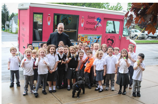
LOWER SCHOOL BEGINS WITH MONTESSORI, CATECHESIS OF THE GOOD SHEPHERD OR CLASSICAL KINDERGARTEN.