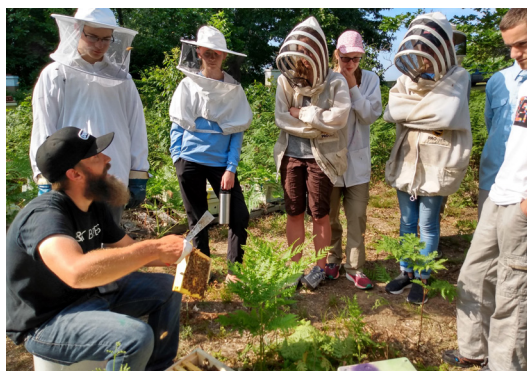
SACRED HEART ACADEMY STUDENTS ATTEND SCHOOL YEAR ROUND AND BEGIN WITH MAGDALENE TERM IN JUNE. MANY SUMMER COURSES TEACH LIFE SKILLS.